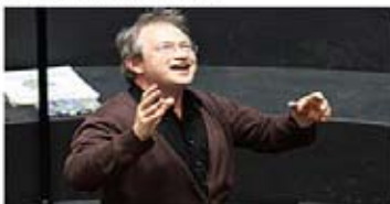
The New Machynlleth Comedy Festival